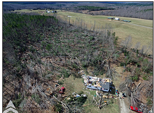
Example of aerial imagery provided by local Section 333 UAS/drone Operators. Tornado damage from February 25, 2016 in Appomattox County, VA.