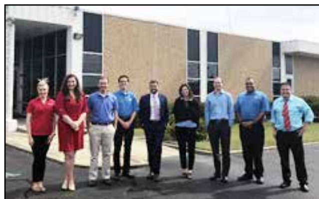
Media attendees that services NWS Jackson County Warning Area