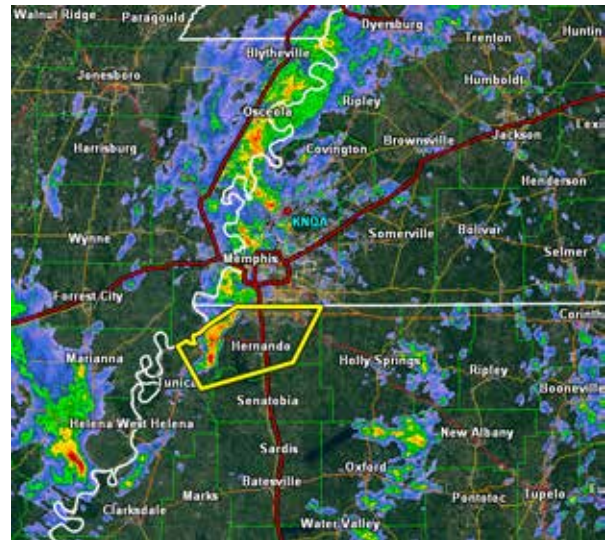
Radar image from 6:57 AM CST December 1, 2018, showing line of thunderstorms approaching the Memphis metro area. A Severe Thunderstorm Warning was in effect just south of Memphis at the time.

"The forecast and expertise provided by the NWS was very timely and accurate. The information provided by NWS played a huge factor in informing our decision to delay the start of the races for safety concerns. The NWS forecast was spot on accurate, which allowed us to make the best decision for the safety of the participants and our staff. The decision to delay the start was the right decision," V.O. Little, ALSAC, Director of Safety and Security.