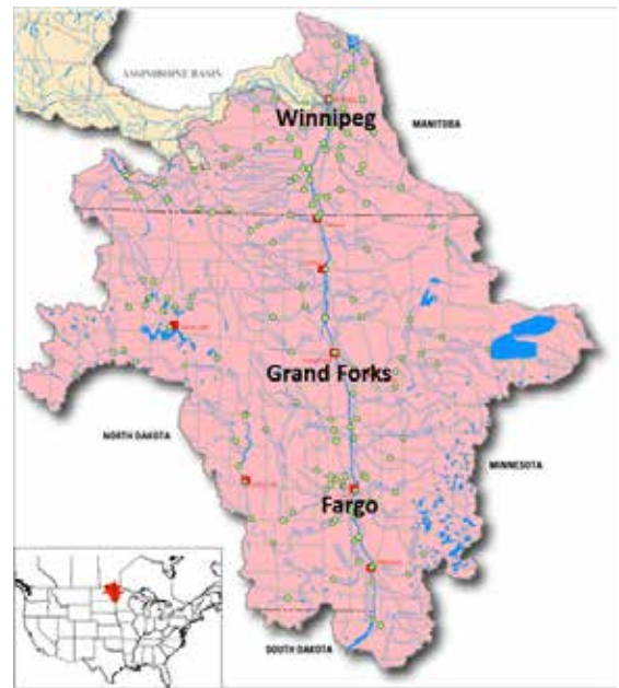
Stream gages within the U.S. and Canadian portions of the Red River of the North Basin: flow is northward, through Winnipeg.

The next partner meeting is scheduled for mid-February and cosponsored by the U.S. Army Corps of Engineers and NCRFC. While winter weather remains fickle and challenging, our seasonal snowmelt flood forecasts and related flood fight efforts are becoming increasingly more accurate thanks to such close partnerships.