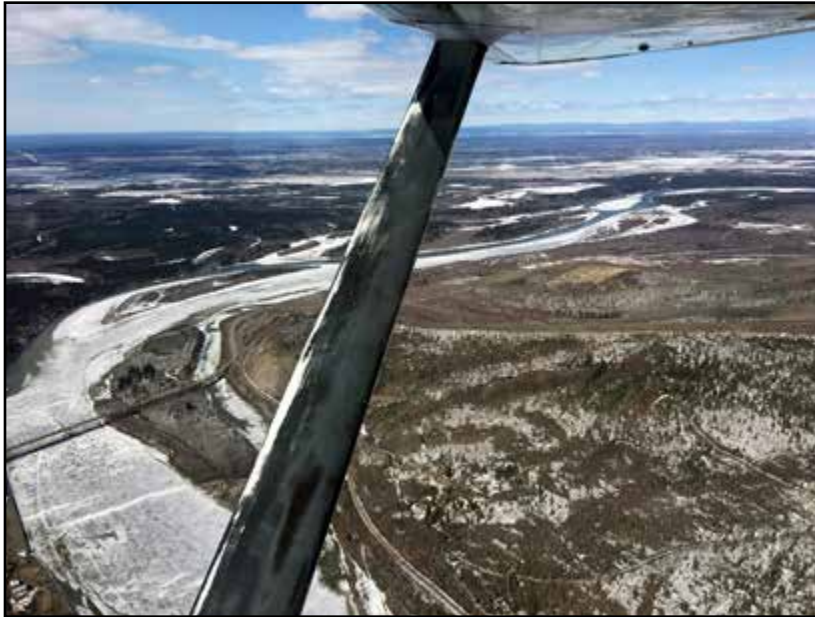
River Watch 2019 team view of Tanana River in Alaska at Nenana looking downstream, courtesy NWS Fairbanks, AK

the Yukon government reported greater than normal snowpack across the Upper Yukon River Basin. March measurements indicated 50 percent greater than average ice thickness in the upper Yukon River Basin at Eagle, AK.