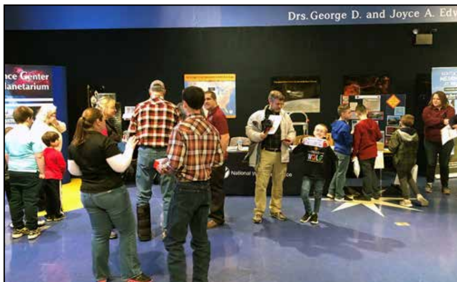
Before social distancing! NWS booth, which included a tornado machine, a draw for all ages.

About 160 people took part throughout the day, making this a successful first year of what we hope becomes a long-running event across the eastern reaches of the Bluegrass State!