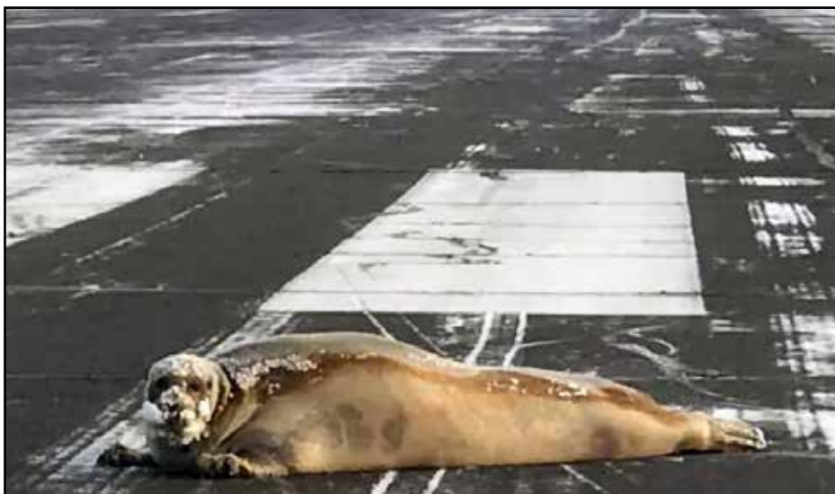
Bearded seal on runway at the Wiley Post-Will Rogers Memorial Airport in Utqiagvik, AK (courtesy Scott Babcock, Alaska Department of Transportation and Public Facilities).

runway, knocking out runway lights and depositing clams. DOT runway maintenance had to wait for local residents to finish collecting the clams before clearing the runway.