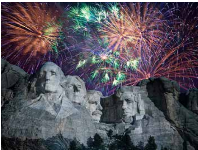
Fireworks over Mt. Rushmore in South Dakota.

The National Park Service (NPS) requested Incident Meteorologist (IMET) support because the fireworks were contingent on a Go/No-Go checklist that included several weather parameters. Along with the potential for wildfires enhanced by moderate drought conditions, the area experiences frequent severe thunderstorms. Further, President Trump announced he would attend, so the White House Military Office forecasters became involved in the planning, adding a whole new level of coordination.