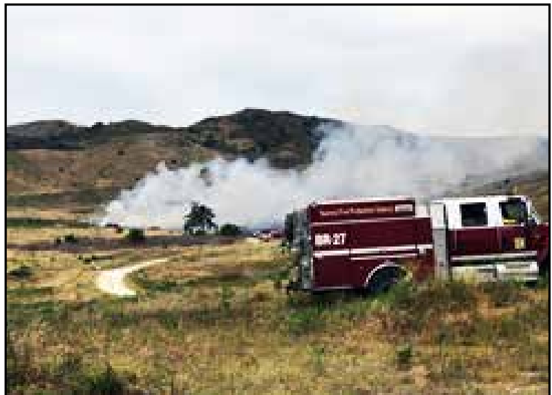
Days 1 and 2 had high clouds and sun with good burning activity due to no marine clouds and breaks in the high clouds.

The firefighters experienced all types of weather, from sunshine and high clouds, clear skies and hot temperatures in the lower 90s, deepening new marine layer and partial clearing over higher terrain, and finally widespread cloud cover, measurable drizzle and even showers on Day 5.