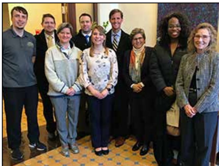
NWS staff meet with Gallaudet University staff to discuss ways to better serve the deaf and hard of hearing community.