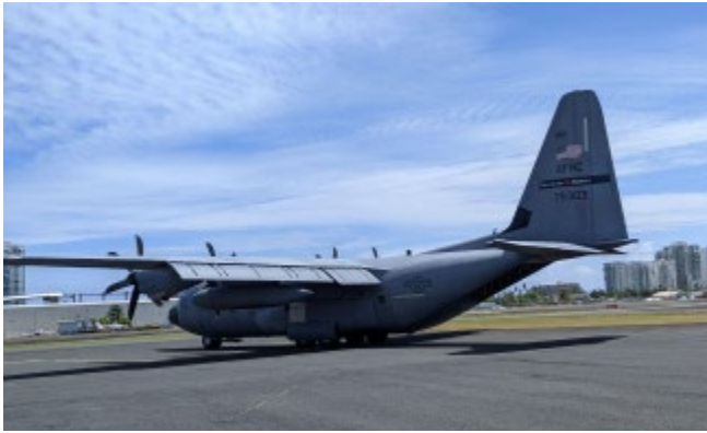
WC 103J Hercules Aircraft at Fernando Luis Ribas Dominicci Airport in San Juan.