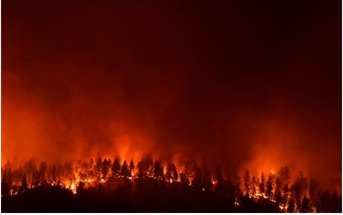
Rum Creek fire near Merlin, Oregon, August 2022

To date, the U.S. has seen more than 50,000 wildfires resulting in nearly seven million acres burned in 2022. Organizing resources and crews to fight wildfires is an enormous undertaking. Today, more than 15,000 wildland firefighters and support personnel are assigned to wildfire incidents across the country. Among the crews are specially trained meteorologists with NOAA's National Weather Service (NWS), called Incident Meteorologists (IMETs).