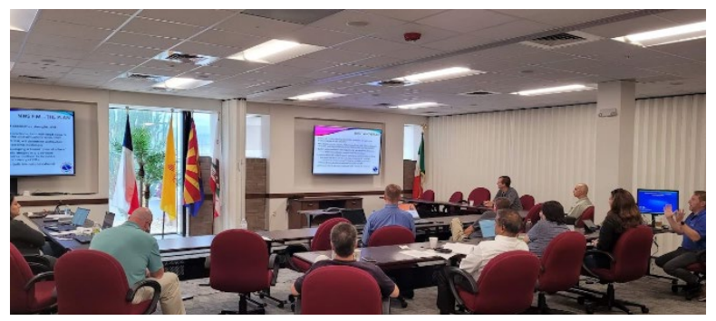
Forecasters from both West Gulf RFC and WFO El Paso at the International Boundary and Water Commission in El Paso, TX

This year, the meeting centered on reviewing the Memorandum of Understanding (MOU), drought services, and hydrologic models used by both agencies, in addition to issues observed along the Rio Grande in recent years. In addition, there was an overview of the West